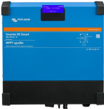
Inverter RS Smart 48/6000